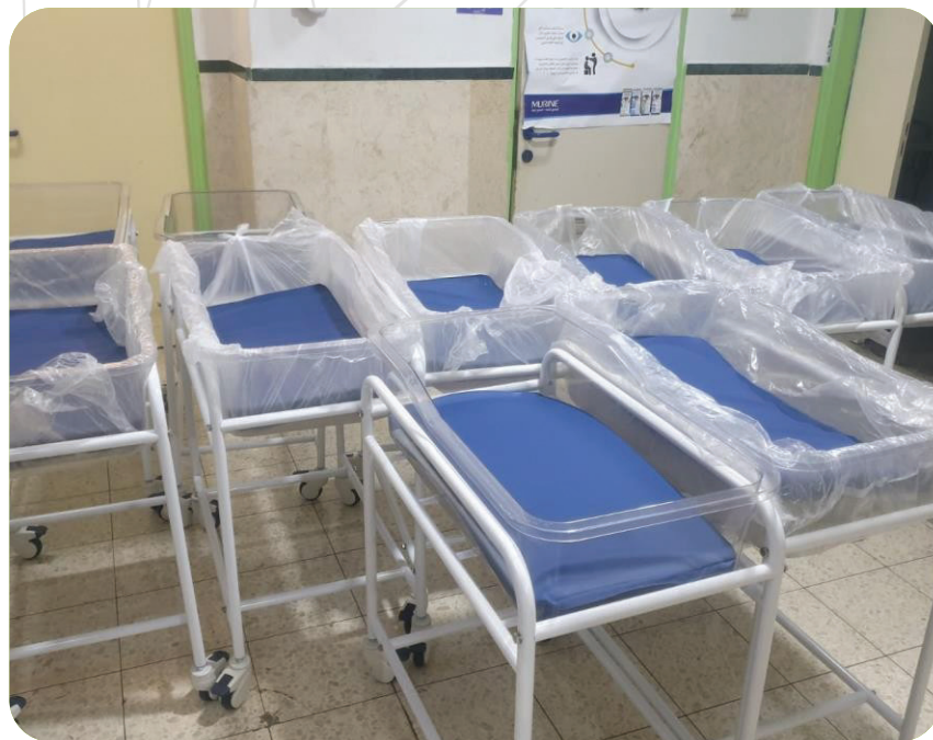
Supplying at installing Baby Cots at Al-Israa Specialized Hospital

CMC has maintained its promise to provide high quality products and devices to serve the health facilities in the Palestinian market.