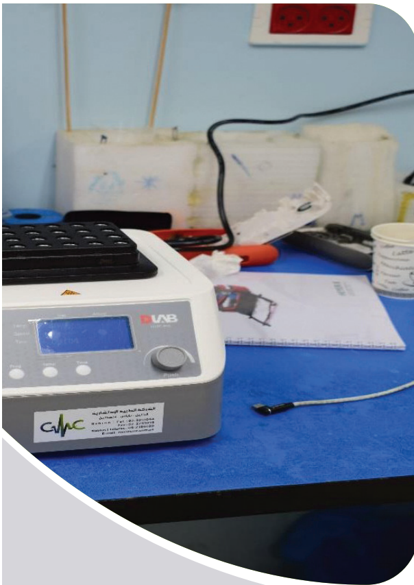
CRS Project: Furniture Equipping and distributing throughout the state