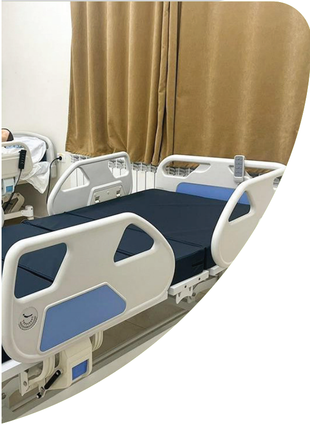
Hebron University: Medical Electric Bed and Emergency Trolley installation at the Faculty of Nursing at Hebron University