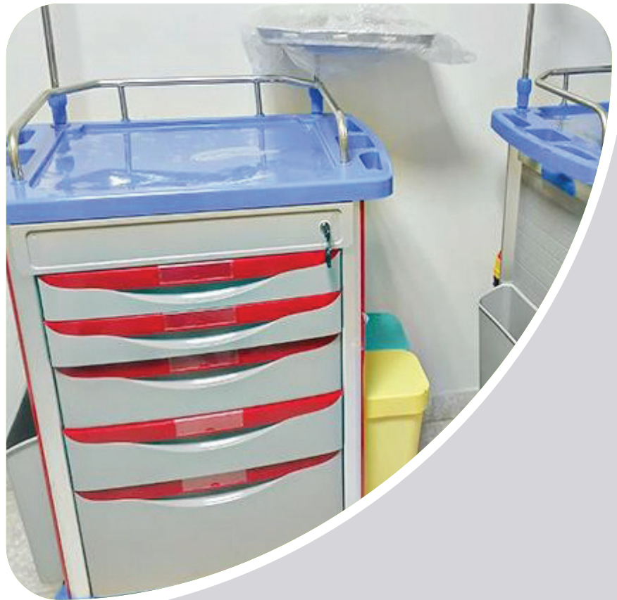
Emergency Trolley installations at Al-Najah National University